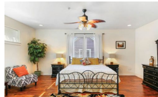
JACKSONVILLE COTTAGES (541) 899-7789 www.JacksonvilleCottages.com 2 2 1,670 Bed Bath Sq Ft