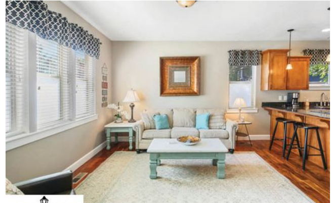
JACKSONVILLE COTTAGES (541) 899-7789 www.JacksonvilleCottages.com 2 2 1,670 Bed Bath Sq Ft