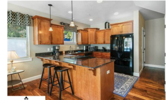
JACKSONVILLE COTTAGES (541) 899-7789 www.JacksonvilleCottages.com 2 2 1,670 Bed Bath Sq Ft